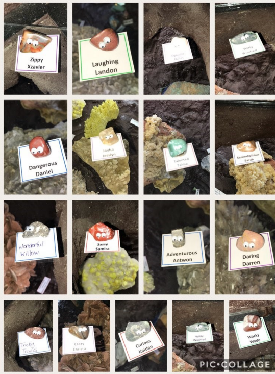
Personalised Rock Pets