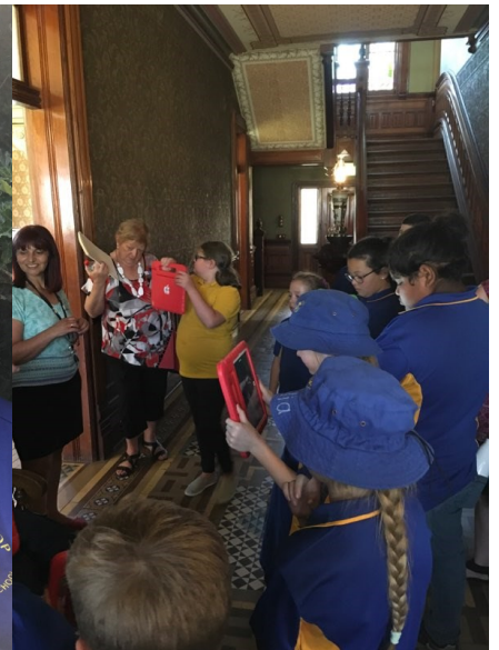
Learning about what life was like for the Chaffey Family in the late 1800's.