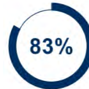
Year to Date (2018)