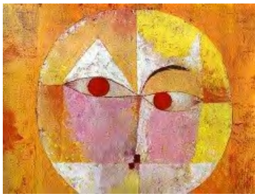
Artist Paul Klee's famous masterpiece 'Senecio'